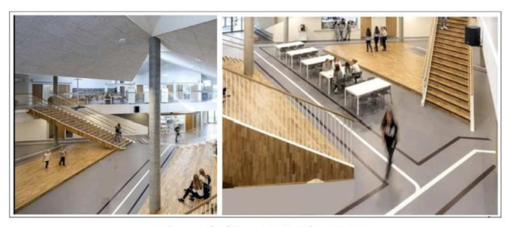
Figure 3. Skovbakke School