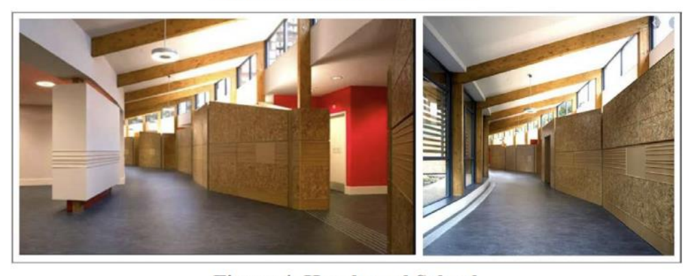
Figure 4. Hazelwood School