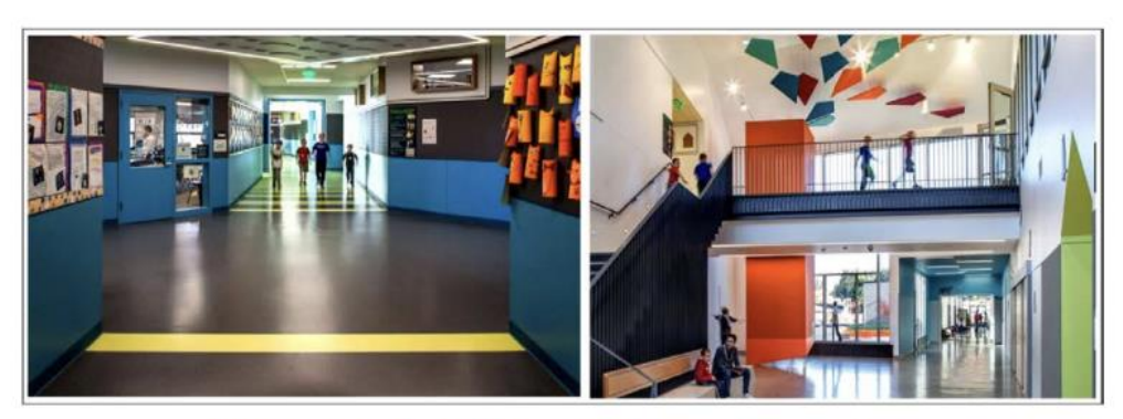
Figure 2. Lake Wilderness Elementary School

To determine the function of navigation in the formation of the design of the Peter G. Schmidt Elementary School (Tacoma, WA), the architects of TCF Architecture use the collage method. This method allows you to combine in one room several information accents, which are decided by the local type of their location: photos, text messages, active use of bright colors and embossed materials for fencing. First of all, we should pay attention to the definition of the principle of safety, which is one of the basic principles of universal design, proposed by architect Ron Mace. Therefore: