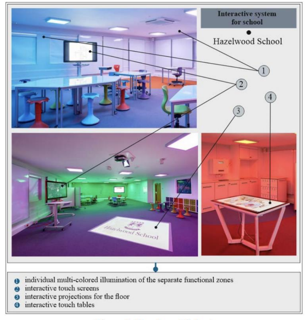
Figure 7. Hazelwood School

A striking example of the integrated inclusion of interactive innovations is the design of the educational space of the Hazelwood School in the UK (Figure 7). According to the concept of the designers of the TaskSpace studio, the following is proposed: 1) individual lighting of the room with