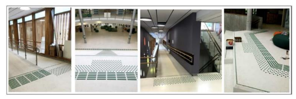
Figure 5. Bergen School

An example of solving the design of the school space in Bergen allows us to reveal the functional-utilitarian and aesthetic qualities of modern schools. The use of TacPro® stainless steel tactile tactile studs on the floor allows visually impaired students to move mobile and indicate the existing priority in choosing the desired direction. In this case, priority is given to professional modeling of the main passage zones and changes in the direction of movement along the perimeter of the architectural space. The tactile indicator message also meets modern aesthetic requirements and is both safe and convenient for school users. The above tools improve their intuitive perception by visually impaired children and promote mobile mobility;