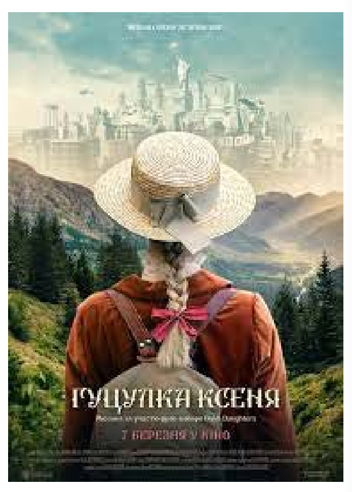
Ill. 7 Film "Huzul Ksenia" ("Huzul Ksenia") (director Olena Demyanenko, 2019)

(2011), the sequel film "Virgin Spirit" [98] (2011) directed by E Weixing, the motion picture by Wu Jinshan's "Painted Skin 2" [99] (2012), the film by the director Lee Goli "Emperor Xuanyuan's Sword" [100], the motion picture by the director Niu Chaoyang "White Fox" (2013) are the live-action films that on the basis of "eternal subjects" create their own film versions.