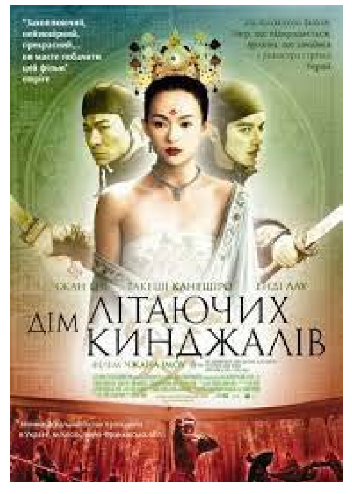
Ill. 5 Film ("匕首之家") ("Bǐshǒu zhī jiā") ("The House of Flying Daggers") (director Zhang Yimou, 2004)

85 Film ("英雄") ("Yīngxióng") ("Hero") (director Zhang Yimou, 2002).