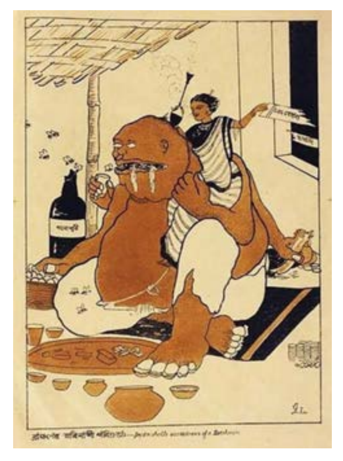
Ill. 7 G. Tagore. "By the Sweat of My Brow" from the album "The Realm of the Absurd", 1917. Ink on paper. Private collection, Kolkata