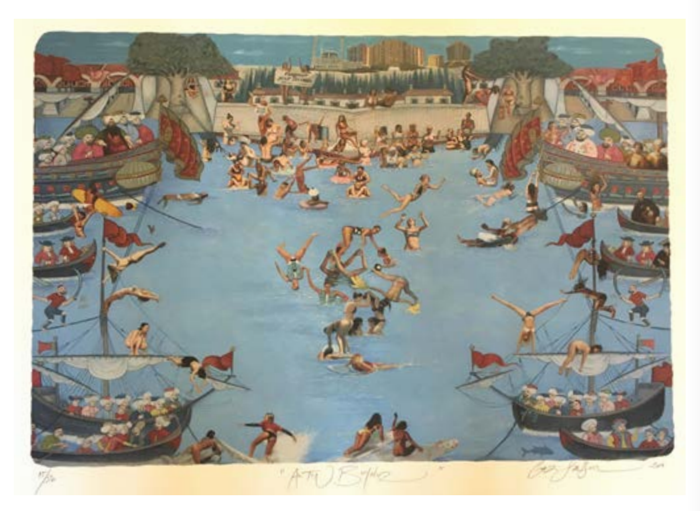
Ill. 3 Gazi Sansoy "Golden Horn" 2013 Painting, 190W x 150H x 3D cm. URL: https://www.saatchiart.com/art/Painting-golden-horn-2013/76913/1920605/view

of Platonism within the framework of the Illuminati school had a tremendous impact on the development of Iranian philosophical thought in subsequent periods. Thus, the thinkers of the Safavid period, especially Mir Damad and Mulla Sadr, in building their concepts, repelled from the Neoplatonic reflections of Suhravardi. Unlike the tradition of peripatetism, which did not survive the "collapse of the positions of the philosophers" of al-Ghazali and ibn Taymiyyah, neoplatonism turned out to be the main language of philosophical reflection of the Iranian (more broadly, Shiite) intellectual sphere throughout the High Middle Ages and Modern Times.