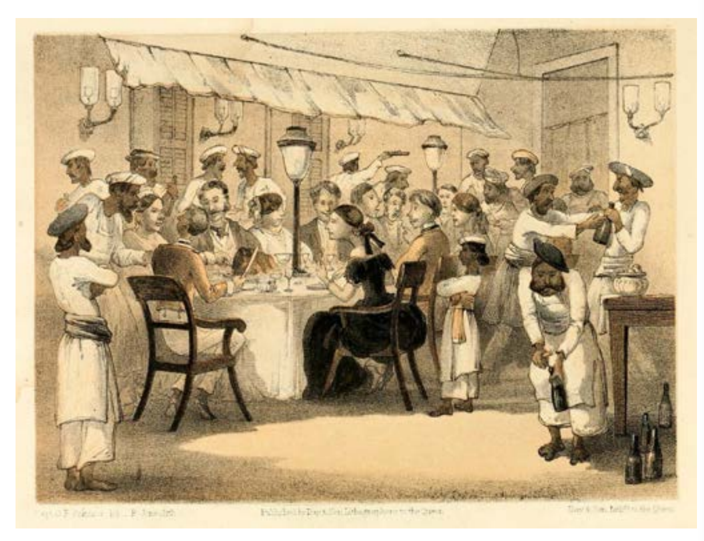
Ill. 2 Illsutration the chapter "Our judge" from the book "Curry and Rice on Forty Plates" by G. Atkinson

In 1912, the leading nationalist weekly magazine "Dawn" explained the reason for the political participation of artists, describing the situation in the following words: "One of the most remarkable, though less pronounced, features of our modern social life are the steady growth of a number of movements, literary, historical and artistic, which represent a distinct stage of the work of the Indian mind in favor of the inspiration of Indian nationalism..."[179]. The Bengali Renaissance, in the sense of cultural regeneration, claimed its golden age to alleviate the sense of inadequacy caused by events around it. Nothing strengthened incipient nationalism more than appeals to the past. Western thinkers viewed history not only as a nation's collective memory, but also as an investment in the legitimacy of their current actions.