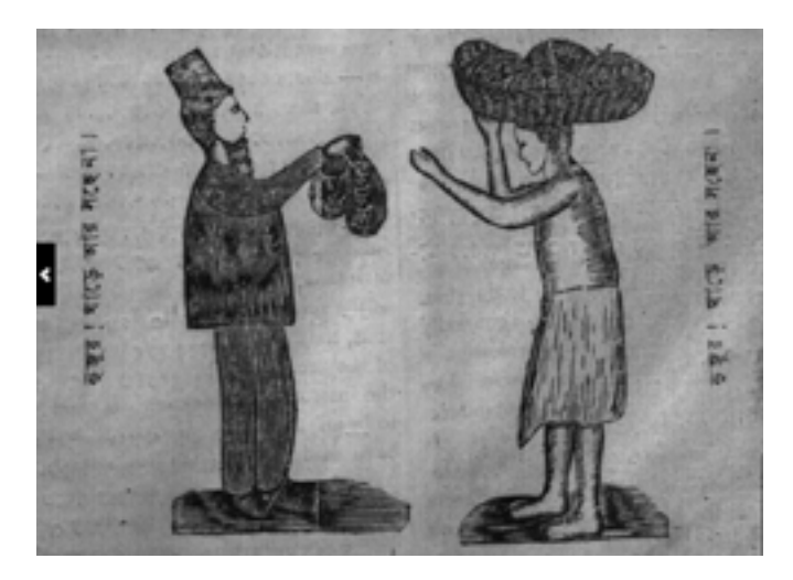
Ill. 5 First caricature in "Amrita Bazar Patrika", 1872. Vol 5. Issue 6 (21 March 1872)

Among the themes of the caricatures, social ones prevailed. For example, in 1878, regular beatings of Hindus by the British became an urgent problem to which Indian society drew attention. The latter avoided justice due to the loyalty of English judges, who saw in the death certificates of the victims an enlarged spleen, a diagnosis also established by English doctors. The suggestion of a conspiracy between European judges and criminals, expressed in the illustration, really had an unexpected effect on society. The cartoon became one of the pieces of incriminating evidence that led to the censorship of the popular press in 1878. And already in 1882, these situations became the basis of Ilbert's bill, the purpose of which was to cancel the immunity of European criminals whose cases could not be tried by Indian courts[196]. The first cartoon magazines were oriented towards the Anglo-Indian way of life and were started by the English themselves. Thus, there are bright glimpses of colonial attitudes. In general, the funniest caricatures, whether English or Indian, focused on an Indian character.