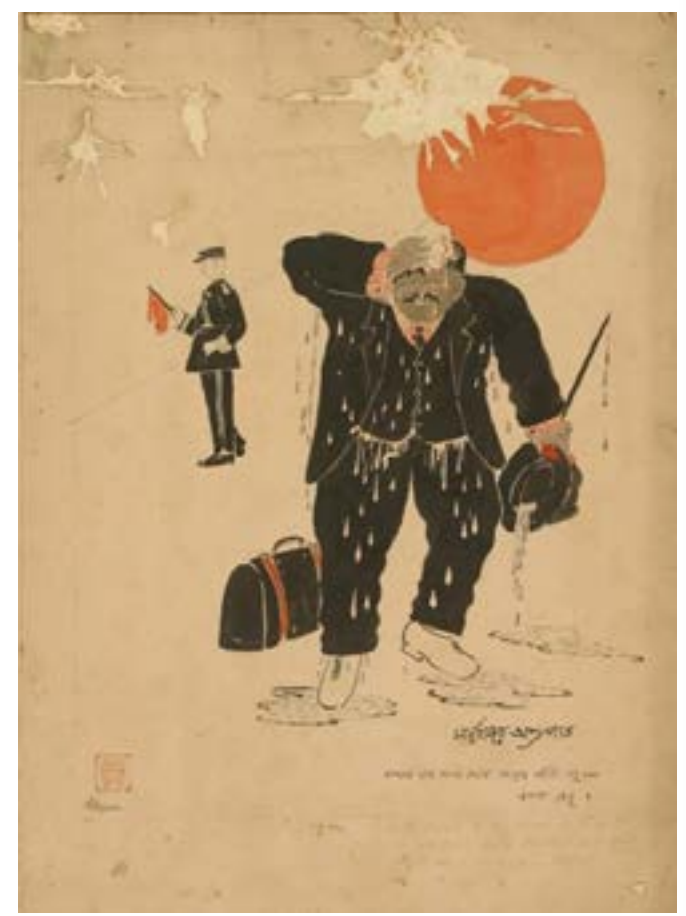
Ill. 8 G. Tagore. "Brahmin of Kaliyuga", from the album "The Realm of the Absurd", 1917. Ink on paper. Private collection, Kolkata

the same intensity. Brutal satires included the destruction of the Indian handloom by Manchester Textiles, the corruption of Calcutta's civic administration and the mismanagement of official famine relief programs.