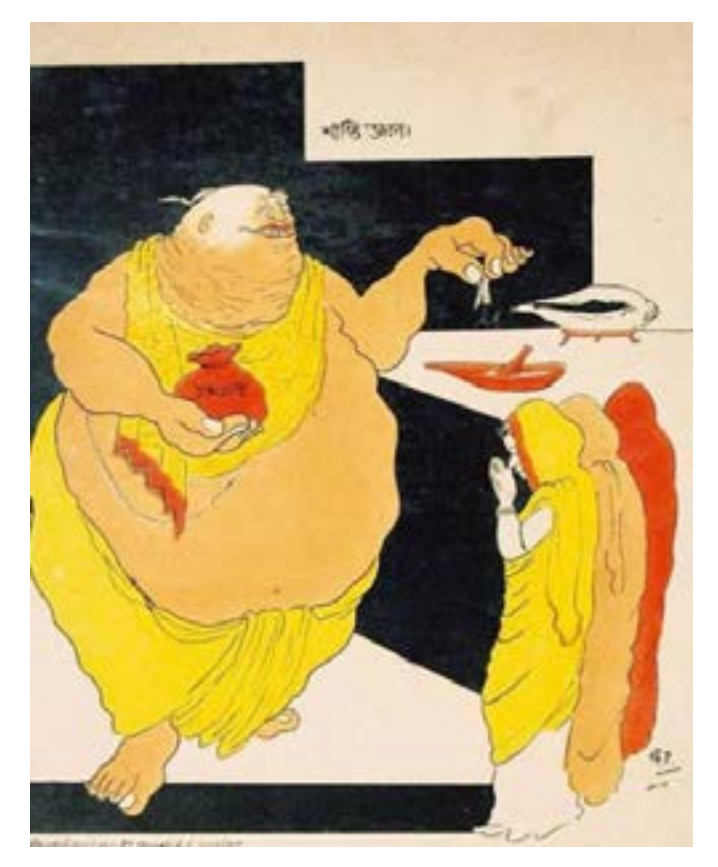
Ill. 6 G. Tagore. "Purification by Muddy Water", 1917. Watercolor, paper. Victoria and Albert Museum, London