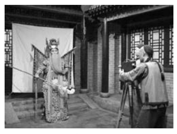
Ill. 2 Scene from the movie "Battle of Dingjunshan" (film company unknown)

The Chinese nation building, different periods (development or unification) of the coexistence of Chinese nationalities, the struggle for power make up the main "storylines" of the famous novel "Three Kingdoms Period" (三國演義, pinyin: Sānguó yǎnyì) (1494). Sānguó Shídài is the period in the Chinese history, the tripartite division of China among the states of Wei, Shu, and Wu, named after the number of 3 kingdoms formed after the collapse of the Han Dynasty in 220. This novel touches upon the issue of the collapse of the Han Empire into three warring kingdoms. The author of the novel Luo Guanzhong has created an artistic picture of a medieval struggle for power, not always following the historical authenticity. However, the plot of the novel became very popular and was adapted by the Chinese opera and later by screen arts. In the late twentieth century the classical novel by Luo Guanzhong was adapted into a Chinese television series "Romance of the Three Kingdoms" (1990-1994)[39]; "Three Kingdoms" (2010) by the director Gao Xixi[40], and individual storylines and episodes became the basis of cinematic adaptations. The most famous of the cinematic adaptations of this novel are Daniel Lee's war action drama "Three Kingdoms: Resurrection of the Dragon" (co-production with South