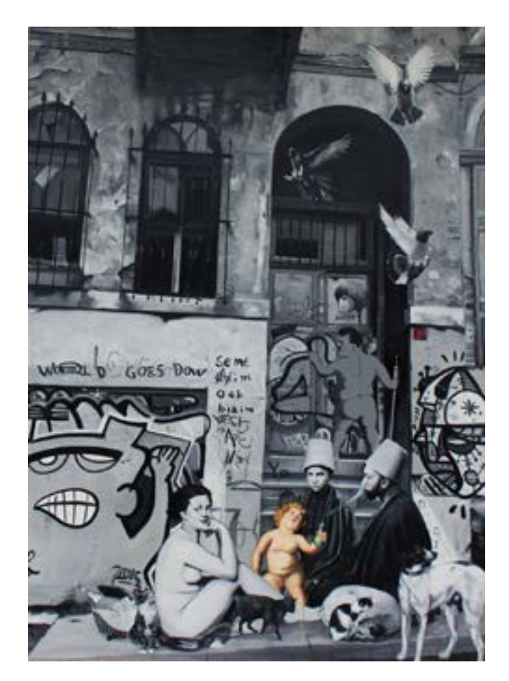
Ill. 4 Gazi Sansoy "Yesterday, Today, Tomorrow, Istanbul, Dervishes". 2017. URL: https://www.sanatgezgini.com\ gazi-sansoy-tuval-uzerine-yagliboya-dun-bugunyarin-istanbul-11335

cal and cultural environment. W. Beck called this phenomenon "convergence of global culture", that is, approaching the same forms and meanings of cultures that have different origins. The condition for convergence is a common environment for the development of cultures of different origins, but unification in this environment is fundamentally impossible.