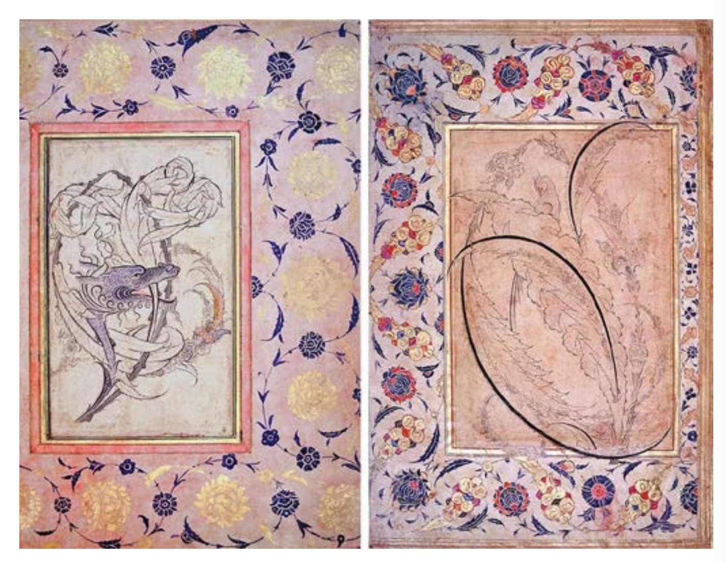
Ill. 1, 2 Two pages from the Sultan Murad III Album. Şahkulu. Istanbul, 1572–73 (ANL Cod. mixt. 313 ff. 11b, 46a). URL: https://commons.wikimedia.org/wiki/File: Two_pages_from_the_Sultan_Murad_III_Album_ (ANL_Cod._mixt._313_ff._11b,_46a).jpg

The artist combined images of collages against the background of photographs of buildings from the beginning of the 20th century, but in a state of "for today", with graffiti on the walls, boarded up doors and broken windows. Color and black-and-white images continue to contrast, emphasize the collage and the different nature of the characters, but they become those accents that, like a loud call for the viewer, make you think about what he sees. In fact, this is how constructive participation works and the return of the communicative form of affect, similar to what we saw in the miniatures of the Saz school. Here, too, a monochromatic pattern hides the participants in the dialogue. Colored inserts of characters, like the blue head of a dragon, line up the semantic accents of the scenes. It is necessary to note one of the works of the series "Yesterday, today, tomorrow, Istanbul" (Ill. 4), where the image of Victorine Meurent, captured in the painting "Breakfast on the Grass" by Edouard Manet, is used as a nude. We are again faced with quoting,