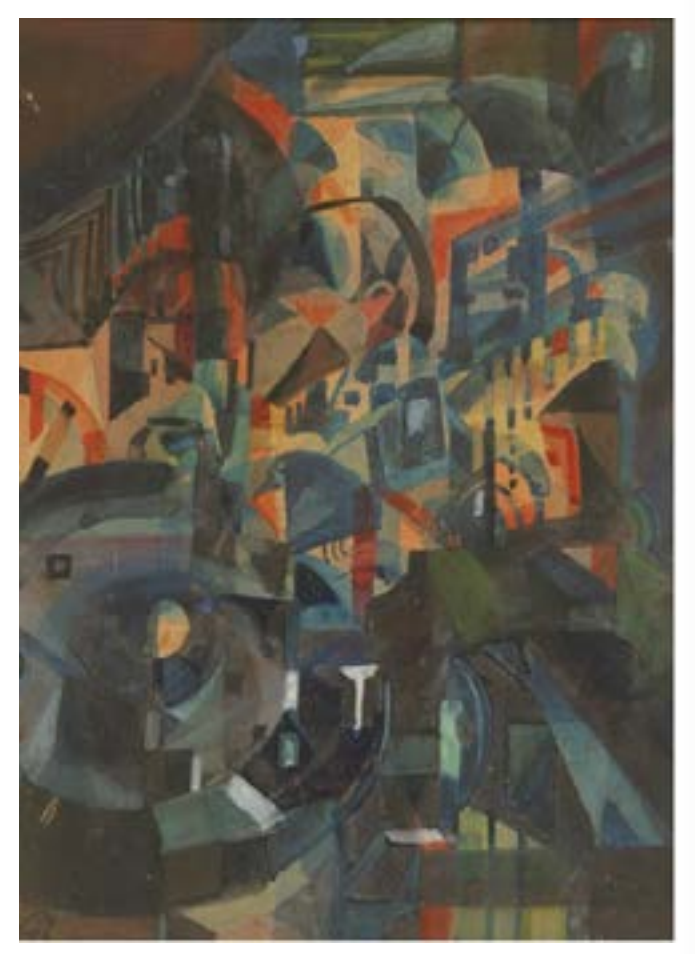
Ill. 10 G.Tagore. "City in the night", 1925. Watercolor, paper. Victoria and Albert Museum, London

The exhibition included the works of members of the Bauhaus school, "The Bridge", and "The Blue Rider". A total of 250 exhibits were designed to explain