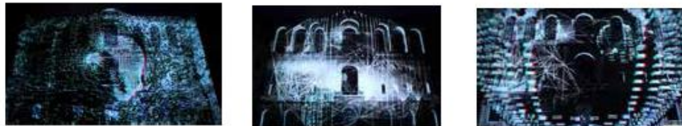
Fig. 4: Techniques of transformation, modularity and cyclicity in 3D video mapping design. Stereo 3d mapping at Mapping Festival 2012, Geneva (Museum of Art and History). 10

• Historical context. The nature of the design concept of 3D video projection is influenced not only by the present, but also by important events of past years. The composition of the 3D image has its own features associated with the geographical, ethno-cultural and other characteristics of the region in which they are created (Fig. 5).