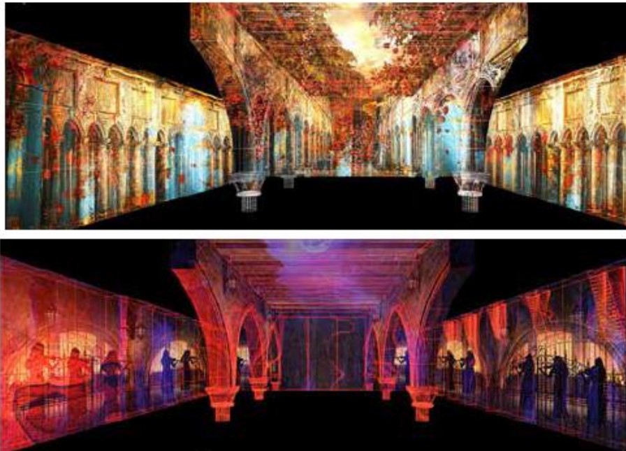
Fig.7. Diocesan Museum of Venice . 13

Among Paolo Buroni's latest innovations are the interactive video images at the Diocesan Museum of Venice (2017), near St. Mark's Square, in which he combines video projection, a 3-dimensional soundscape and olfactory effects to present the famous figure of Venetian musician Antonio Vivaldi. Buroni's design concept represents an innovative form of interactive art, a completely new way to recreate cultural heritage. The formation of this composition of images, sound and smells is associated with the activation of memory and imagination of both the artist and the viewer. Premonition of the expected and the surprise of discoveries contribute to the pleasure arising from the 3D video mapping and create unique impressions (Fig. 7). The meaningful openness of this interactive artistic work contributes to the formation of the viewer's understanding of the relationships between code systems and signs, providing a methodical education by means of professional art.