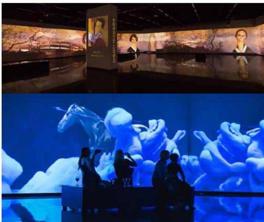
Fig.1. a and b: Exhibition “Avant-garde. Space of colours and shapes”, ART Mall shopping and entertainment center, Kyiv (2014).

A striking example of the above is the multimedia exhibition “Avant-garde. Space of colours and shapes”, an exhibition on the avant-garde which took place in 2014 at the ART Mall shopping and entertainment centre in Kyiv, Ukraine. Episodes of images in the multimedia performance revealed the art of the avant-garde in all its variety of colours, genres and directions. Works by prominent avant-garde artists such as Amedeo Modigliani, Vasyl Kandinsky and Kazimir Malevich were presented at the exhibition, in a bespoke video projection designed to be projected on the walls of the gallery by means of A-Sense technology (Fig. 1-2). The author of the project created an individual artistic space through the preservation of authentic cultural codes. The main concept is the reproduction of cultural heritage traditions by means of modern visual culture.