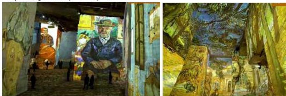
Fig. 2: Exhibition of works by Vincent van Gogh: Center for Digital Art L'Atelier des Lumièresbis, Paris (2019). 8

Given the realities of today, it can be noted that the role of media design as a phenomenon of modern culture is actively growing. Rapid changes in this direction allow us to identify ways to optimize its growth. As shown by the material of the developed project proposals, in addition to the above components, the criteria for evaluating multimedia art in the exhibition system are: script, multimedia communication language, interface, functionality and ergonomics (usability). The system-forming factor plays an important role in shaping the design of the exhibition space with the use of interactive technologies. It affects the quality of interaction in the system "personality - society - culture".