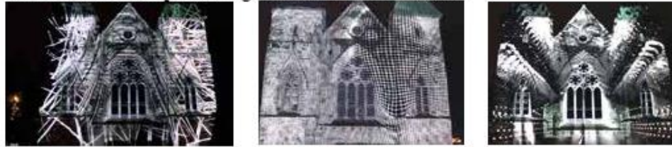
Fig. 3: Techniques of transformation, modularity, cyclicity in 3D video mapping design. BORDOS_ARTWORKS at Screen City Festival 2013, Stavanger, Norway. 9

techniques of transformation, modularity and cyclicity (Fig. 3-4). In the examples below, the multimedia video sequence designed to be projected onto the facades of landmark architecture is created as several separate images that enable a stereo effect.